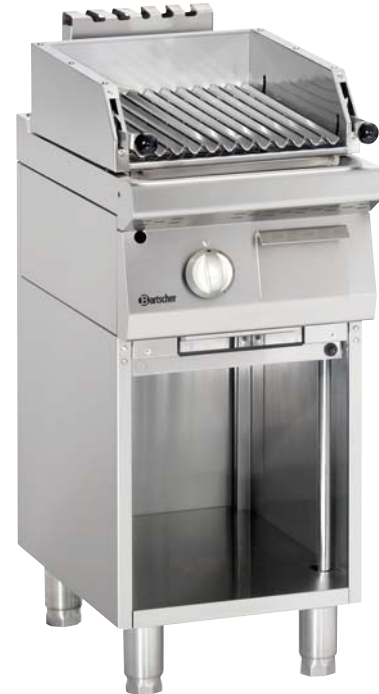
Filling volume lava rock 4,5 kg

W 400 x D 700 x H 850-900 mm Power: 9 kW gas with piezo ignition height adjustable grid (V-grid) for meat Grilling surface: W 350 x D 530 mm Weight: 54 kg GTIN 4015613486161 Code-No. 2856201