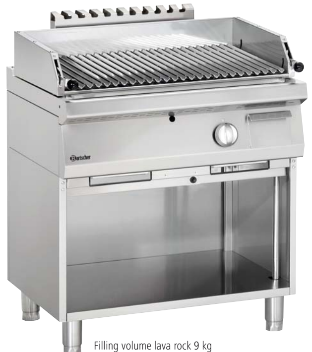
Filling volume lava rock 9 kg

W 800 x D 700 x H 850-900 mm Power: 18 kW gas with piezo ignition height adjustable grid (V-grid) for meat Grilling surface: W 750 x D 530 mm Weight: 76 kg GTIN 4015613486178 Code-No. 2856301