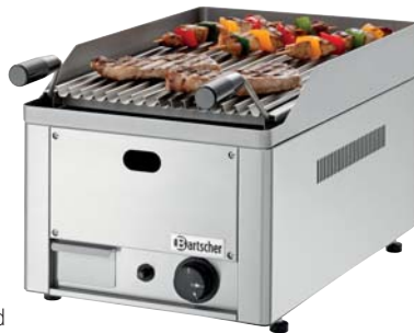
Table-top gas lava rock grill 40 with grid for meat

Fast, clean and healthy barbecuing: the meat juices and residues are caught in the water pan. Chrome nickel steel Grill surface: 280 x 445 mm 3-level temperature setting by knob operation Fast heating up time: approx. 2,5 minutes in highest level Water pan 1/1 GN for easy cleaning Heating indicator light Power: 4,08 kW / 400 V 50 Hz 3 NAC Size: W 320 x D 630 x H 320 mm Including cleaning scraper Weight: 12,9 kg GTIN 4015613642024 Code-No. 370037