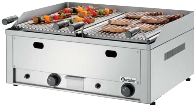
Table-top gas lava rock grill 70 with grid for meat

Stainless steel Grilling surface 2x 312 x 483 mm Power: 8 kW Size: W 660 x D 570 x H 282 mm Weight: 40,6 kg GTIN 4015613404622 Code-No. 2006601