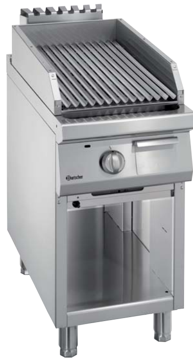
Filling volume lava rock 6 kg

W 449 x D 810 x H 178 mm grid (V-grid) for meat Grilling surface: 420 x 675 mm Weight: 10 kg GTIN 4015613527918 | Code-No. 296465