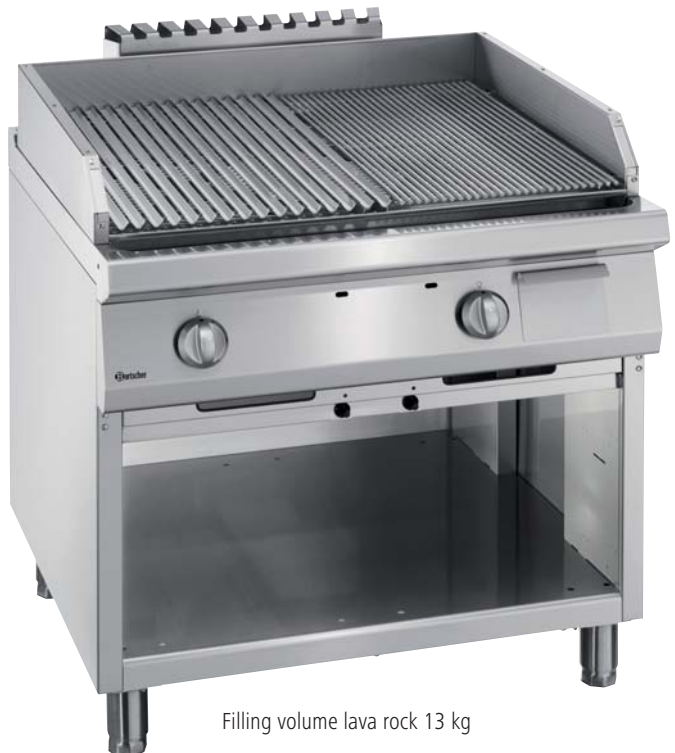
Filling volume lava rock 13 kg

W 900 x D 900 x H 850-900 mm Power: 22 kW gas with piezo ignition Grid (round bar grid/V-grid) for fish and meat Grilling surface: 870 x 675 mm Weight: 112 kg GTIN 4015613486369 | Code-No. 2954621